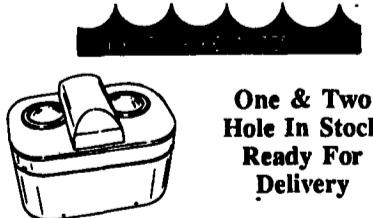
One & Two Hole In Stock Ready For Delivery