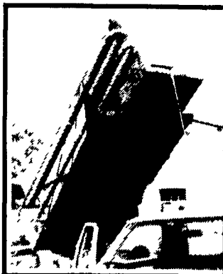
Take 'em Down!

We Stock Truckloads Of Chore-Time Bins & Miles Of Chore-Time FLEX-AUGER