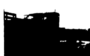
1974 CHEV C85 20' Stake With Truck Away LR Gate, 6.1 Liter, V8, 5 Spd. Trans, PB, 23,000 GVWR. Well Maintained.

"COME TO ROYAL, WHERE EVERYONE IS TREATED LIKE A KING"