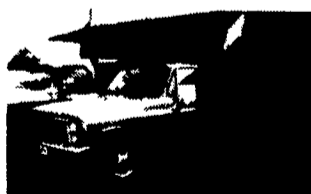
1984 GMC 2800 8' Pickup, 350 V8, 4 Spd. Trans., PS, PB, AC, 88,000 Miles w/Rebuilt Engine. "Don't Delay, Won't Last Long"