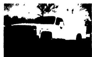
1979 Chevy C30 4x4 Utility Body, V8, AT, Trans., Local Trade $1,885