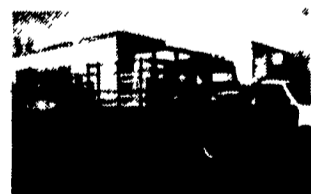
1989 INT. $1800 16' Stake w/Lift Gate V8, 5/2 Spd. Trans., 21,000 GVWP. "Great For A Farm Truck"

6910 Route 309 Coopersburg, PA 18036 (215) 282-4090 (800) 283-4090 FARMERS "FALL" SALE