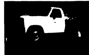
83 FORD F250 8' Diesel, 6.9 Liter, AT, PS, PB, AM/FM Cass., 8800 GVWR. "Make Me A Stake Body"