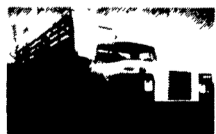
78 INT. $1800 14' Stake Dump, 345 Int. Gas, 5 Spd., PS, PB, WPTO, 19,200 GVWR. "Oldie But Goodie"