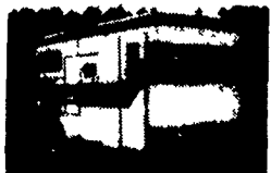
Two horse with 5 ft. dressing room