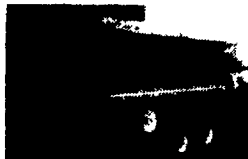
4 Horse Stock Trailer