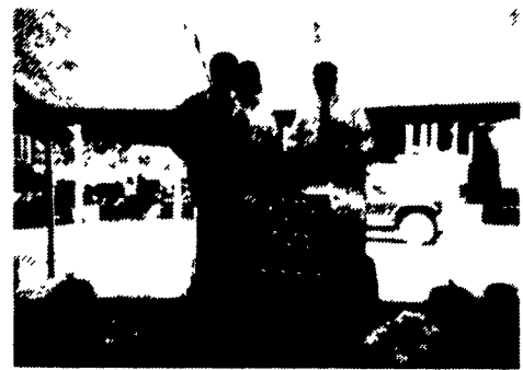
Champion Sheep East Penn Manufacturing