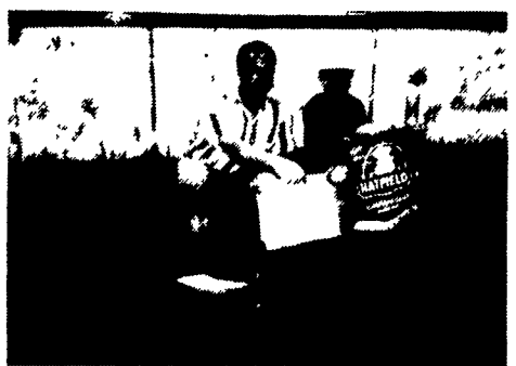
Champion Hog Hatfield Quality Meats

Reserve Champion Sheep - Pennsylvania National Bank Reserve Champion Beef - Keystone Farm Credit, A.C.A. Reserve Champion Hog - Wayne Feeds