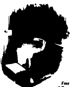
Free 8 Page Colour Brochure Several models available like the non-electric "ME"

"SUN-MAR" The World Leader in COMPOSTING TOILETS • NO Septic System • NO Chemicals Save the Environment! Recycle Back to Nature!