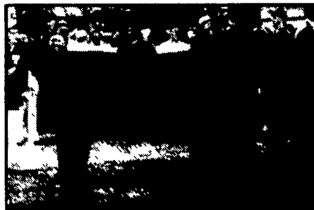
1992 PA Farm Show Grand Champion Steer

Selling 40 thick cross bred steers; Calves born March, April, May & June; Sires Represented: Zapper, Akeem, Sweet Willie, Pistol Pete, KK New Design