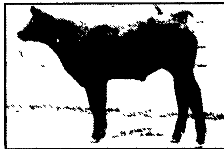
LOT 317 Zapper/Maine