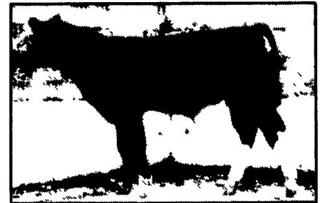
LOT 413 Akeem/Chi x Angus