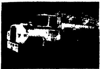
1 Of 12

AUCTIONEERS & ASSOCIATES LTD. Professional Construction & Industrial Equipment Auctioneers 7704 Mapleville Rd., P.O. Box 222, Boonsboro, MD 21713-0222 (301) 738-0638 • TOLL FREE (MD) 1-800-310-2844 • FAX (301) 432-2844 With Offices in Boonsboro and Hagerstown, Maryland