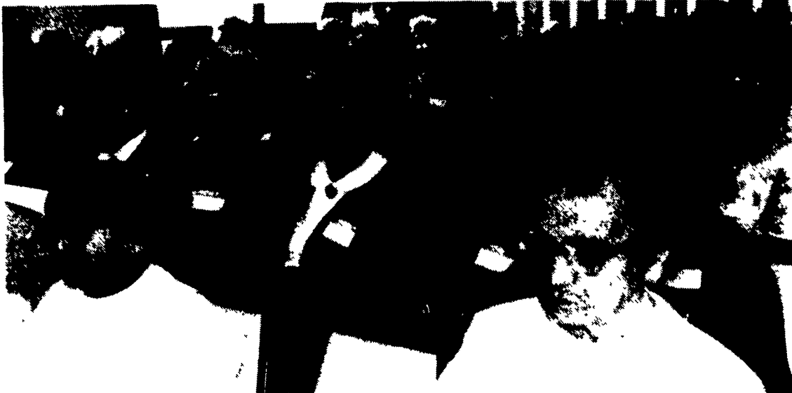
More than 160 members attend the 53th annual convention of the Lebanon County Society of Farm Women.