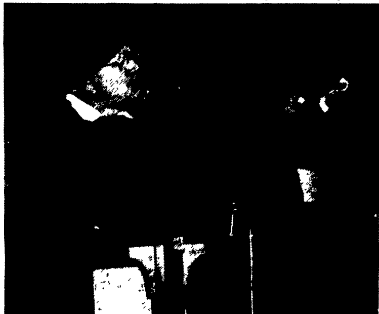
Tillie Hiernerschnitch says she is a "blabbermouth" from Yummerdall where brains are a luxury and not standard equipment.