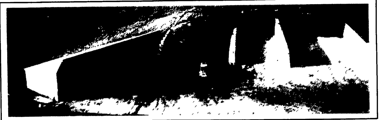
Commodity Bins And Trench Silos

• Retaining Walls • Bunker Silos • Manure Storage, Etc.