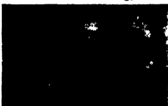
One of Three Stage Coaches

Lebanon is approximately 30 miles East of Harrisburg; approx. 15 miles East of Hershey; approx. 20 miles North of Lancaster; South of Interstate Route 81 and 25 miles West of Reading, PA. Watch for auction signs.