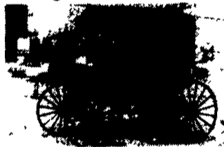
Auto Top Surrey