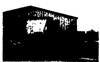
1987 Kawasaki 3800 Hr. In Excellent Condition