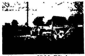
Vermeer 454A Ditcher With Deutz Diesel In Good Condition $6,500