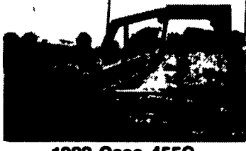
1988 Case 455C, 945 Hours, Excellent Condition $23,900

1988 Sakai SW-41 52" double drum, 384 hrs..... $32,000 * 1991 Sakai SV70D 67" Smooth drum, 368 hrs..... $50,000 * 1990 Sakai SV91D 84" smooth drum, 554 hrs..... $62,000 * Drum Drive