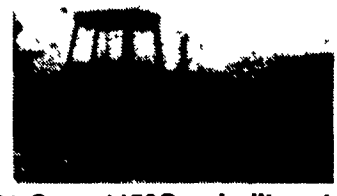
'81 Case 1150C, rebuilt motor, rebuilt U/C, 6 way blade, excellent $21,000