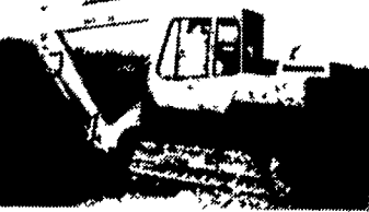
Mitsubishi 90 Excavator Good Condition $18,500