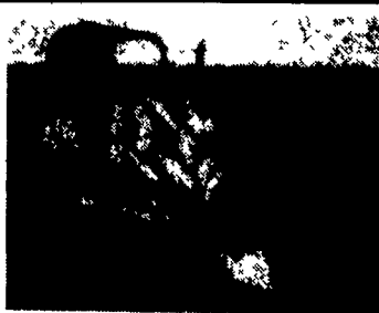
JD 350C Rebuilt Motor, new tracks, good UC $13,000