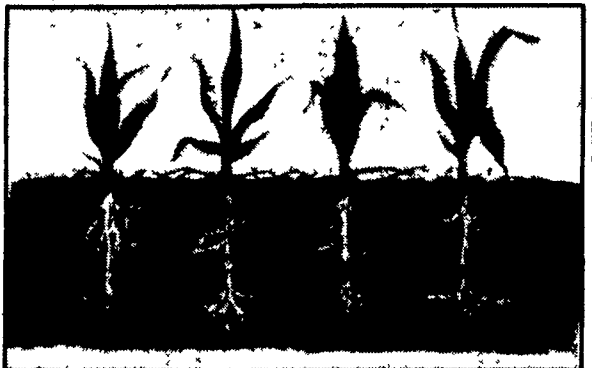
The Zone-Builder creates a passage through hardpan.

Solving the yield-limiting factor of hardpan is the first step toward successful implementation of Zone-Till. Only the Rawson Zone-Builder™ from Unverferth is designed specifically for that purpose. The Zone-Builder slices through this tightly compacted soil to create a passage that allows plant roots and soil moisture to move freely into the subsoil.