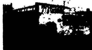
1988 GMC 7000 22' Flatbed Stake Bulk Head & Tie Downs. Remanufactured 6.2 Diesel, 5 Spd., PS, PB, 23,000 GVW, No CDL Required. "Farmer's Don't Delay"

Just Off I-76, Between Allentown & Quakertown Financing Pre-Approved