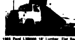
1983 Ford LN8000 18' Lumber, Flat Bed Dumps, Bulk Head, Tie Downs & Rollers, Twin Cyls, Triple Stage Sizzor Hoist, 3200 Cat 200+ HP, 5/2 Spd., AB, All In Excellent Condition & Fleet Maintained. 2 To Choose From

TWO ACRES OF ALL TYPES USED TRUCKS. "IF WE DON'T HAVE IT, WE'LL GET IT"