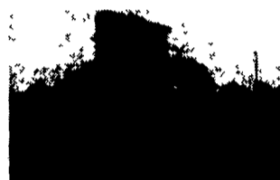
84 Int. 1754 12' Low Profile Contractors Dump, Del., 5 Sp. 21,800 GVW (No CDL Req.) Sparkin' New Body - Don't Delay On This One!