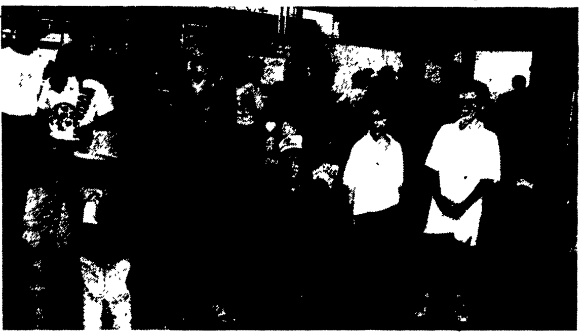
Saturday is Kid's Day at KiLE. These kids watch as others participate in the many contests held during Agri-Kid Olympics sponsored by Lebanon Valley National Bank.