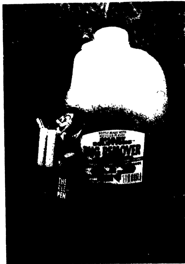
Two new corn-based products on the marketplace are the biodegradable green pens and the ethanol-based bug remover.