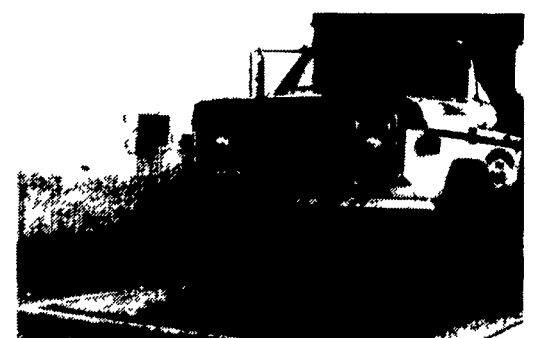
Scale indicator can be mounted in an outside environment on a nearby building or on the optional indicator stand.