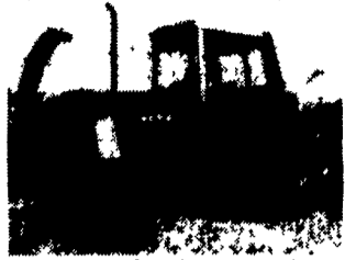
1977 International 1086 18.4x38, 3 Remotes 540/1000 2,400 Hours, Sharp.