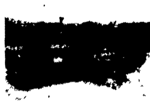
BMB 12' Dyna-Fall Stalk Shredder, 1000 PTO.