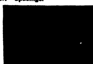
Glencoe Series III 9 Tooth Soil Saver (Sharp).