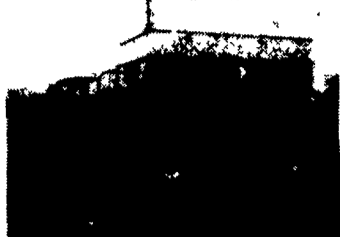
(8) New And Used Gravity Flow Wagons - A Good Selection.