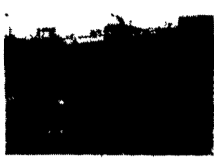
International 500 13' Cutting Disc, 22" Front Blades- 20" Rear Blades, 10 1/2" Spacings.