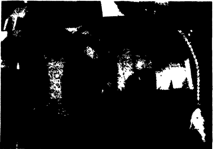
There was at least one orange and black cow at the York Fair - this entry in the pumpkin decorating contest wearing a first-place blue ribbon.