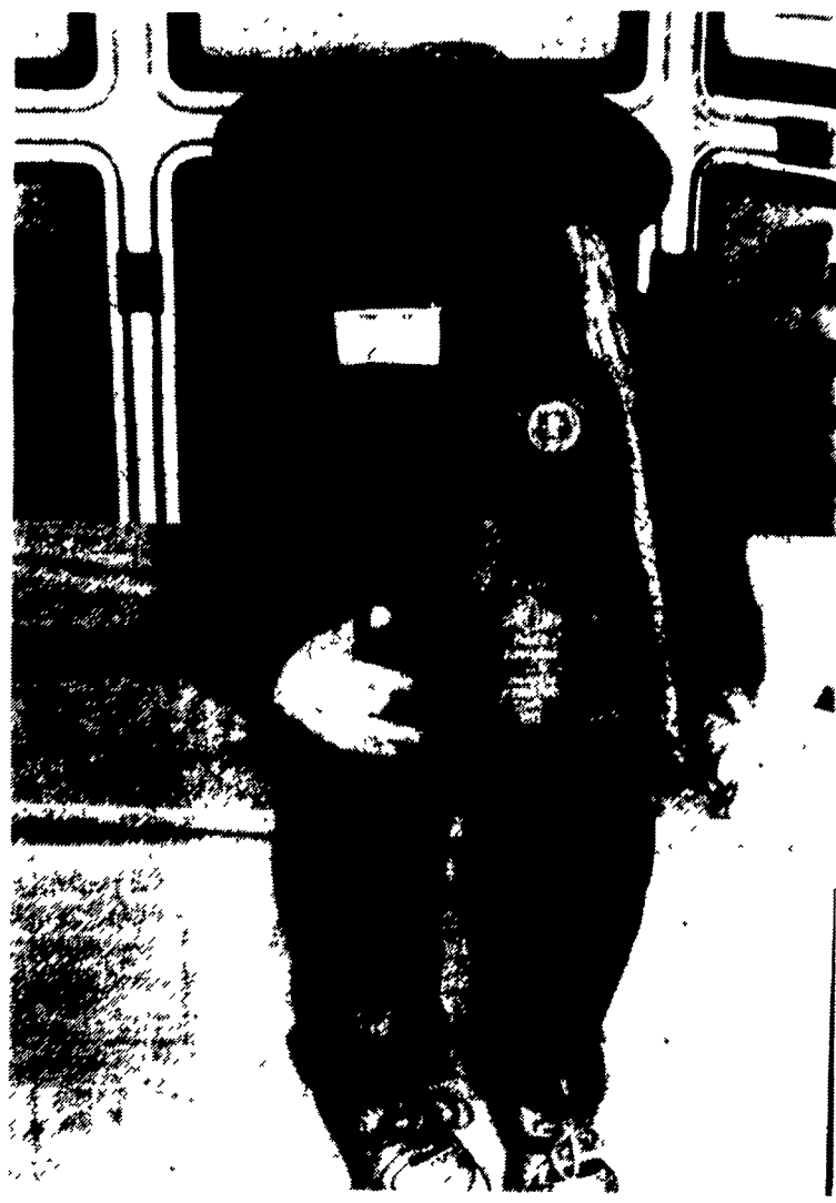
Perched on the champion display table at the pumpkin contest was this three pumpkin-stuffed person which took a top prize.

And, in the York Fair pumpkin contest, each pumpkin is a winner. Every single entry goes home with a shiny, rosette ribbon.