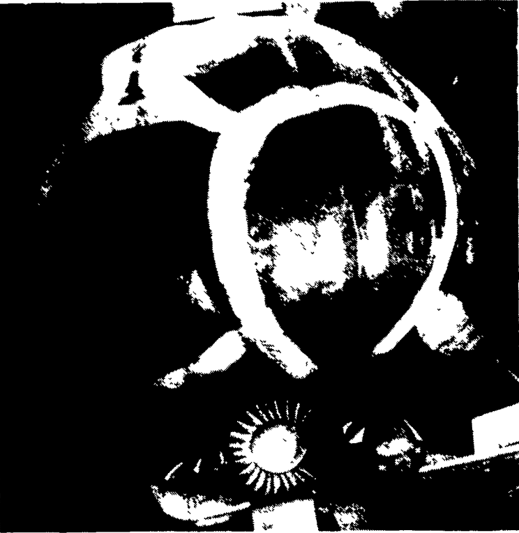
One huge pumpkin entered in the contest came as a giant, green, sea turtle, complete with a butternut-squash head.