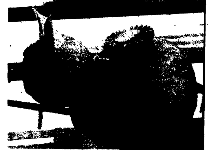
This little piggy went to the fair.