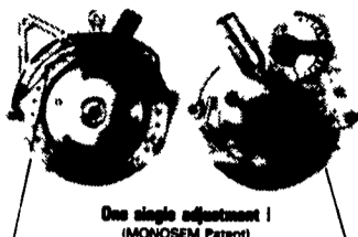
One single adjustment | (MONOSEM Patent)

—A new generation of planters ahead of its time —