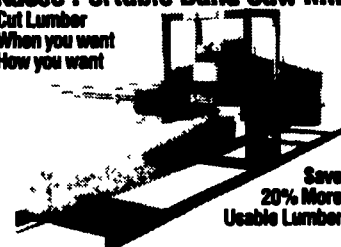
Save 20% More Usable Lumber

Kasco Portable Band Saw Mill Cut Lumber When you want How you want