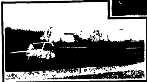
We Will Assemble & Deliver Bins To Your Farm