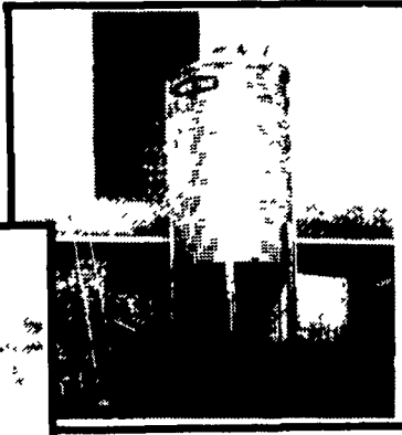
Put 'em Up!

We Stock Truckloads Of Chore-Time Bins & Miles Of Chore-Time FLEX-AUGER