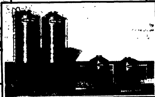
Bins... Large Or Small

Authorized CHORE TIME Master Distributor