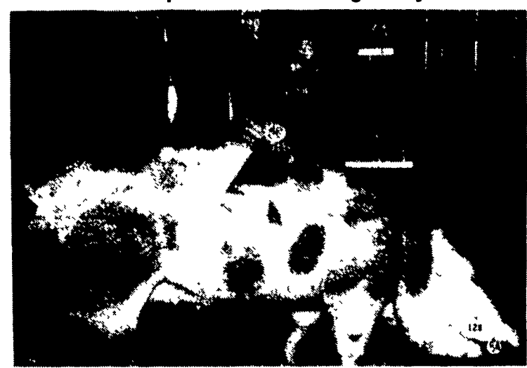
The champion 4-H market hog was shown by Crystal Charles.