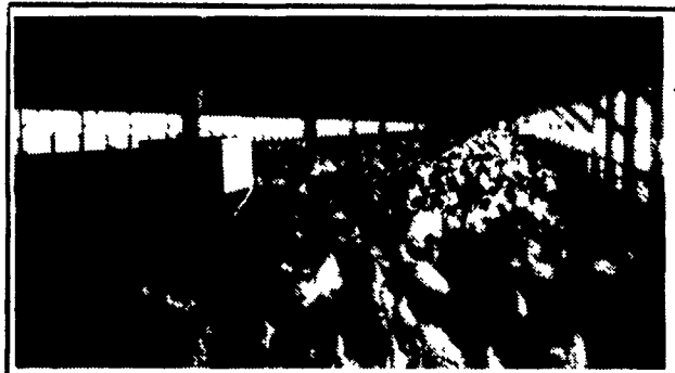
Inside Turkey Facility