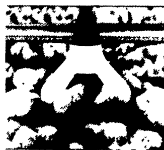
Model H2 feeder with feed chutes (top photo) lets you start chicks with less labor, than finish them