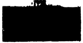
White Row Crop Cultivators are designed for high speed

hardpan by tilling 4" to 6" deeper than chisel shanks. This reduces compaction problems. And our leveling bar option provides a smoother surface for your next pass.