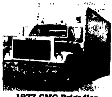
1977 GMC Brigadier 290 Cummins, 13 Sp. Trans. 4.11 Rears, 20' Van Body, R.U. Rear Door, Side Door, Lift Gate $6,500

PARTS & SERVICE 7 DAYS, 24 HRS. We Never Close! MOTOR TRUCK EQUIPMENT COMPANY 198 Kost Road/P.O. Box 1922 Carlisle, PA 17013-0922 Office (717) 766-8000