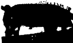
Grand Champ Boar 1992 KILE