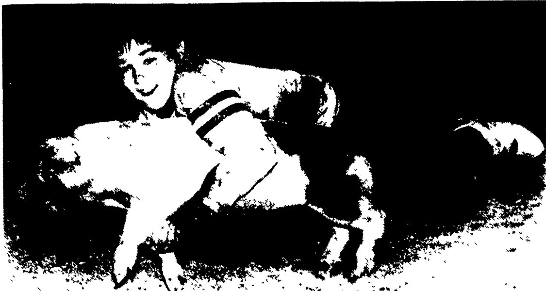
Gotta. Or does he? The pig chase provides plenty of thrills for those adventurous enough to enter.