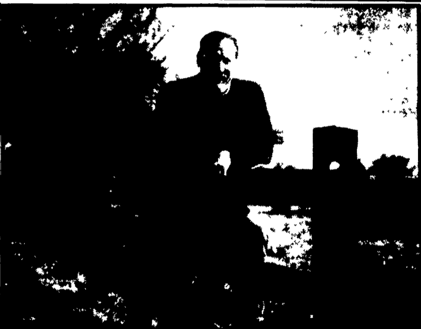
Slip Board, installed 1986

See your Bobcat dealer for a demonstration!