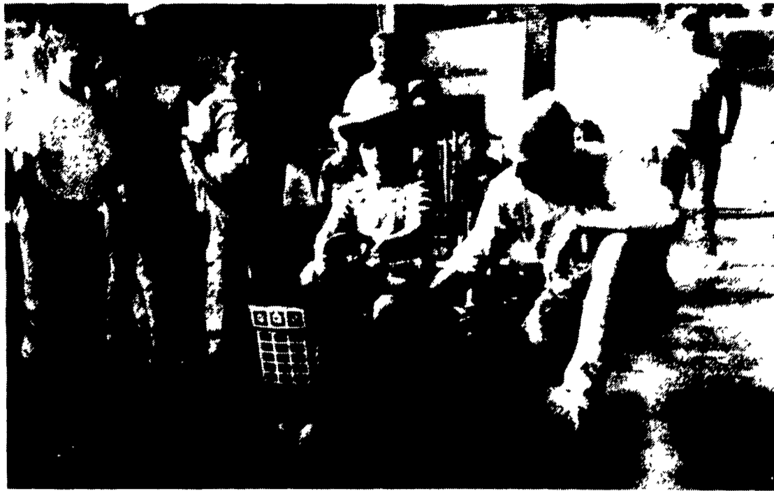
Scenes like this can be expected again at Kid's Day.

So, why not plan to bring your children to the 1993 Keystone International Livestock Exposition at the Farm Show Complex in Harrisburg, PA.