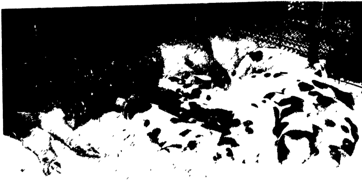
See the little pigs with their mother.