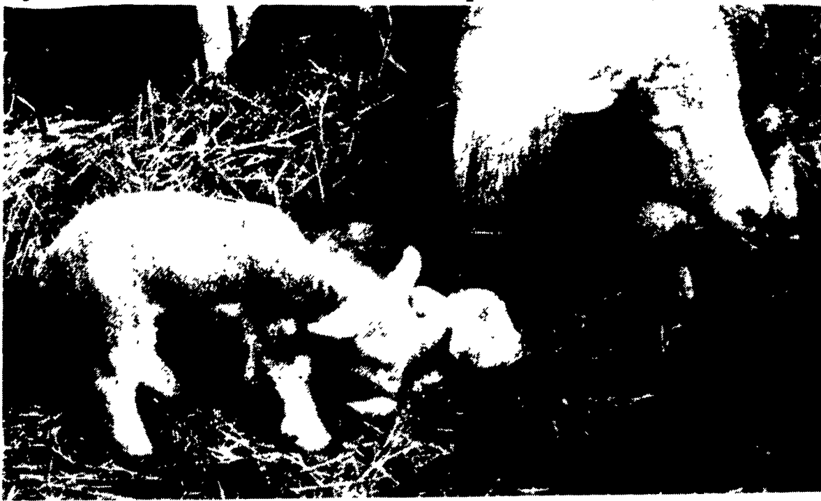
Lambs are part of the fun for visitors to KILE.