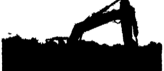
Inley H1000 Excavator, Excellent Undercarriage, GM Diesel, Runs Good, Good Bucket, Reasonable. $12,500