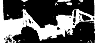
1987 Bobcat 743 Diesel Skid Loader, Good Tires, New Bucket, New Paint, Runs Good. $9,500