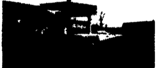
Advance 5600D Sweeper-Diesel, HI Dump, Cab, Hydrostatic, Runs Good. $5,900