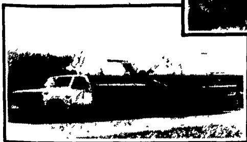
We Will Assemble & Deliver Bins To Your Farm