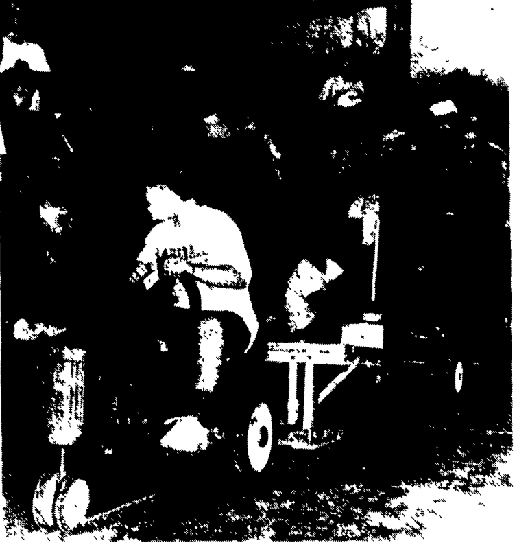
A pint-sized foursome led by Becky Aurand chugged their pints of white milk while farther up the ring bigger kids downed bigger quarts.