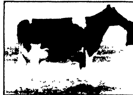
SOUTHWIND Dtr: Roylane Southwind Pansy VG-88 1-11 2X 365d 24,730 4.7% 1172F 3.7% 911P Roylane Registered Holsteins, Warden, WA