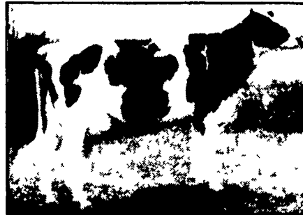
MELWOOD Dtr: Ellbank Bora Mel Alice EX-91 2-04 2X 362d 23,567 4.1% 970F 3.5% 824P Ellbank Farm, Stanley, NY

STARDUST is a new St. Jacobs ABS/ABS Canada release. His type proof places him in the top one percent of the breed for Type in Canada. STARDUST daughters are tall, strong, deep bodied cows with desirable udders and a near correct foot and leg. He's a sire of show-winners.