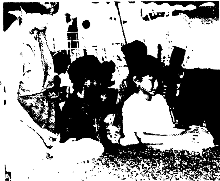
Some enjoyed petting the rabbits at the Mount Joy 4-H Rabbit Club exhibit at the Elizabethtown Fair last week.