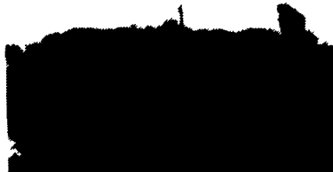
John Deere 210C TLB w/ROPS Canopy, Standard Hoe, Runs & Operates Very Good $13,900

717-664-2444 717-665-2354 FAX 717-664-2835 NEW & USED Farm & Construction Equip.