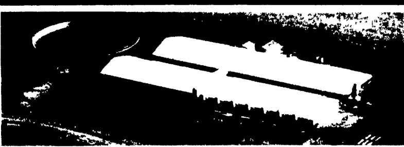
Recently Completed 1200 Sow Unit