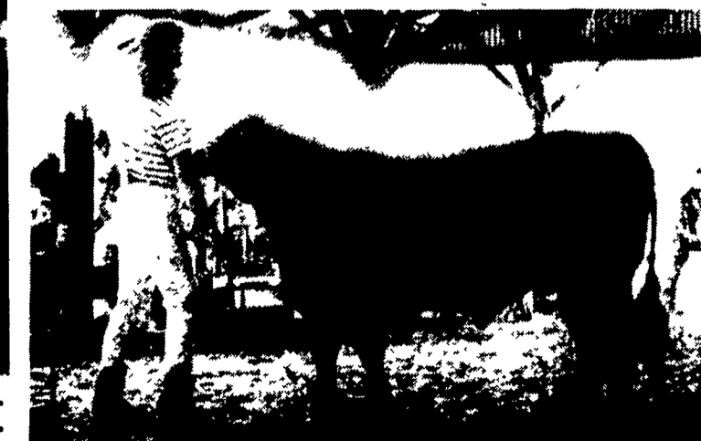
Stacey Graves of Little Marsh leads her grand champion market steer in the arena at the Junior Livestock Sale.