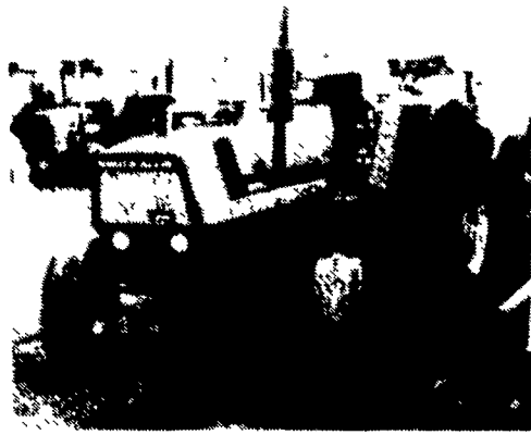
Deutz DX 90, 5,590 Hrs., Fresh Motor Overhaul, Radial Tires $8,500.00