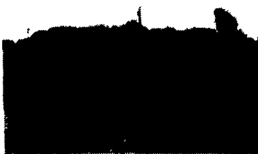
John Deere 210C TLB w/ROPS Canopy, Standard Hoe, Runs & Operates Very Good $13,900

RT. 72N, Manheim, PA. 717-664-2444 717-665-2354 FAX 717-664-2835 NEW & USED Farm & Construction Equip.