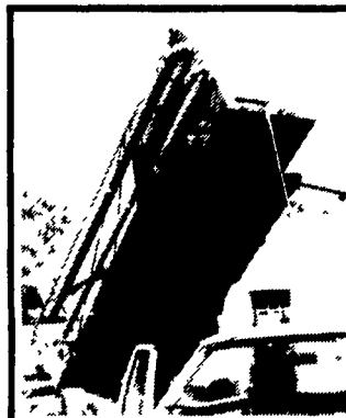
Take 'em Down!

We Stock Truckloads Of Chore-Time Bins & Miles Of Chore-Time FLEX-AUGER