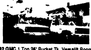
82 GMC 1 Ton 2 1/2' Bucket Tr. Versalift Boom With Onan 2.5 Watt Generator. 350 V8, 4 Spd., Utility Owne & Maintained Since New.