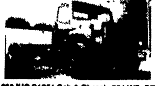
1983 GMC S1954 Cab & Chassis 204 WB, DT 466, 210 HP, 5 SP Trans, AB, Ideal For Grain Tr. or Flat Bed Dump, Very Clean, Fresh Red Paint, Exc. Mechanical Cond.

TWO ACRES OF ALL TYPES USED TRUCKS. "IF WE DON'T HAVE IT, WE'LL GET IT"