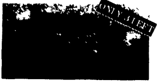
1992 Ford E-350, Enclosed Utilities, 351 VA, AT, PS, PB, Low Mileage, 7,000 Wat. Water Cooled Generator (Built In) Very Clean Tks. Owned & Maintained by Local Utility Co.

Just Off I-78, Between Allentown & Quakertown Financing Pre-Approved