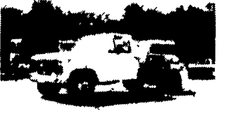
Ford F350 Cab & Chassis 351, V8, 4 Spd., PS, PB, 11,000 GVW, Several To Choose From.....$3,950 Ea. With New Stake Body.....$4,950