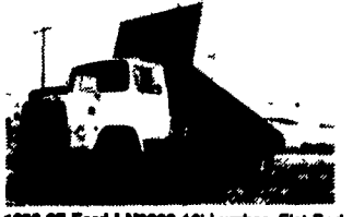
1993-87 Ford L-Series 16' Lumber, Flat Bed Dumps, Bulk Head, Tie Downs & Rollers, Twin Cyls, Triple Stage Sizzor Holst, 3208 Cat 200+ HP, 5/2 Spd., AB, All in Excellent Condition & Fleet Maintained.