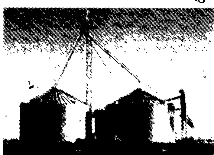
Check Our Low Prices Before You Buy