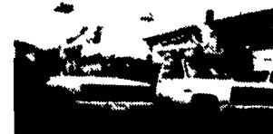
82 GMC 1 Ton 24' Bucket Tk. Versalift Boom With Onan 2.5 Watt Generator. 350 V8, 4 Spd., Utility Ownes & Maintained Since New.