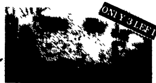
1982 Ford E-350, Enclosed Utilities, 351 V8, AT, PS, PB, Low Mileage, 7,000 Wat. Water Cooled Generator (Built In) Very Clean Tks. Owned & Maintained by Local Utility Co.

Just Off I-78, Between Allentown & Quakertown Financing Pre-Approved