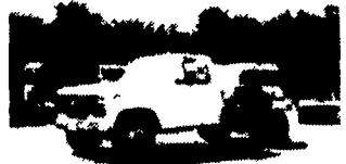
Ford F350 Cab & Chassis 351, V8, 4 Spd., PS, PB, 11,000 GVW, Several To Choose From.....$3,950 Ea. With New Stake Body.....$4,950