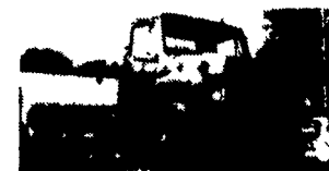
1983 IHC S1954 Cab & Chassis 204 WB, DT 408, 210 HP, 5 SP Trans, AB, Ideal For Grain Tk. or Flat Bed Dump, Very Clean, Fresh Red Paint, Exc. Mechanical Cond.

TWO ACRES OF ALL TYPES USED TRUCKS. "IF WE DON'T HAVE IT, WE'LL GET IT"