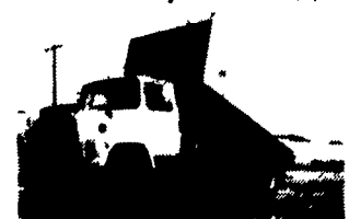
1983-87 Ford L9000 16' Lumber, Flat Bed Durps, Bulk Head, Tie Downs & Rollers, Twin Cyls, Triple Stage Sizzor Hoist, 3200 Cat 200+ HP, 5/2 Spd., AB, All in Excellent Condition & Fleet Maintained.