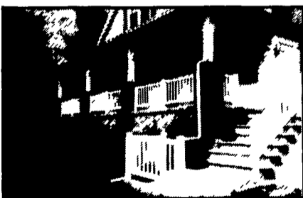
Vinyl Porch Railing

Now There Is A Fencing And A Lumber Substitute That Resists The Elements And Is Great For The Environment.