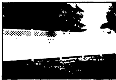
Privacy Fencing With Lattice

RESOURCE LUMBER Is An Extruded 100% Recycled Polythylene Plastic In Typical Lumber Lengths and Widths Excellent For Numerous Maintenance Free Exterior Applications. PVC FENCING Is A Durable And Beautiful Product That Makes An Attractive Fence In Many Styles To Choose From, Maintenance Free, 20 Year Warranty, Quality Installation and Free Estimates.