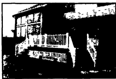
Resource Lumber Deck