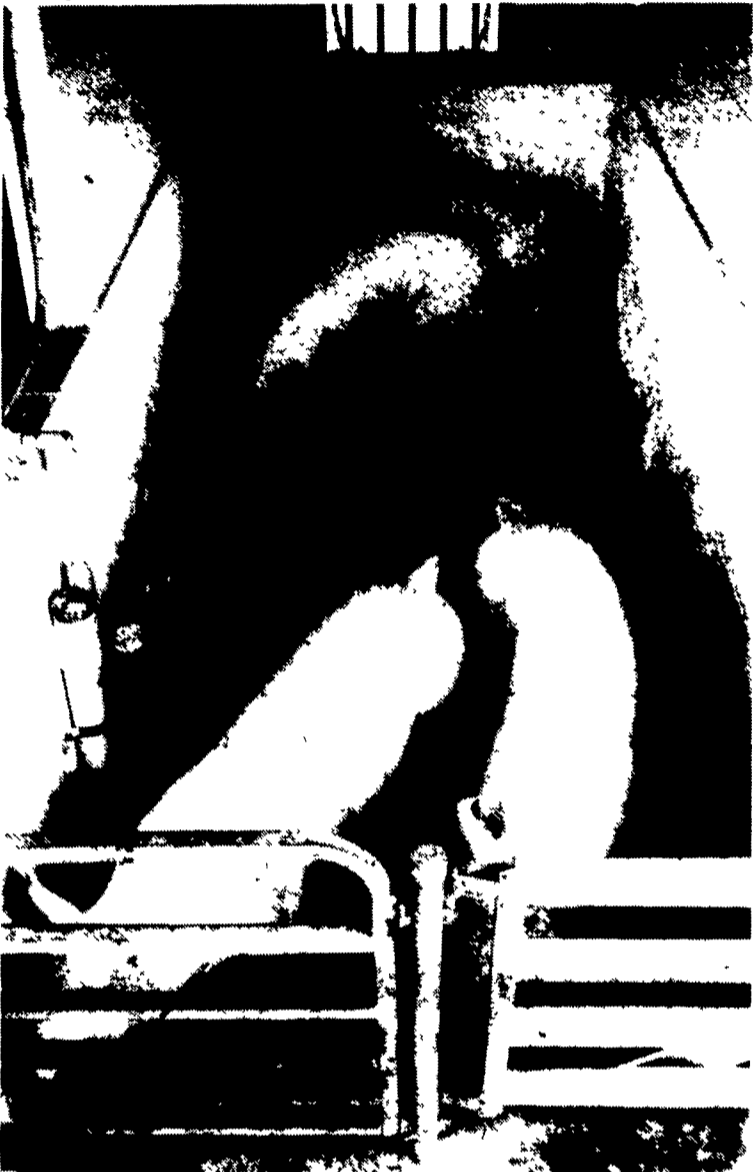
Pennsylvania's 18th Performance-Tested Boar Sale gets under way at 6 p.m. on August 18 at Penn State's Meat Animal Evaluation Center.

Nationally, 19.9 million acres of cropland will be idled under the 1993 farm programs and devoted to conserving use.