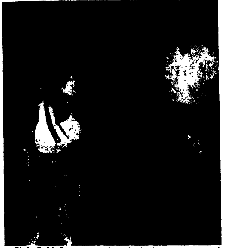
Chris-Gold Guernseys show both the reserve grand champion Guernsey and the grand champion Guernsey of the Shippensburg Fair.