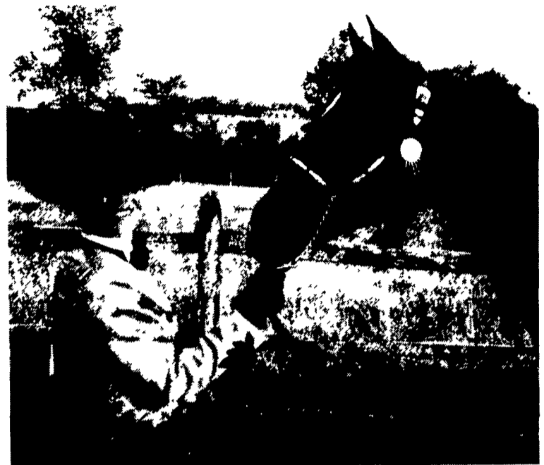
Jennifer Goodman, 4-H Roundup show multiple winner.